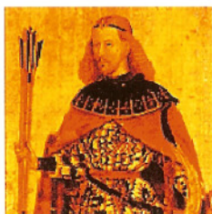
Ausiàs March (1400-1459)